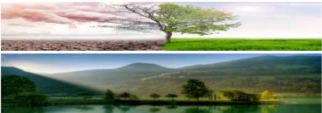
Miic, 1.8: garbô tuxxiqi

Garbo kak iyyaanam uunyi cooxuy ittata xaquh yaniy mangohiyya kinni. garbo caxâ