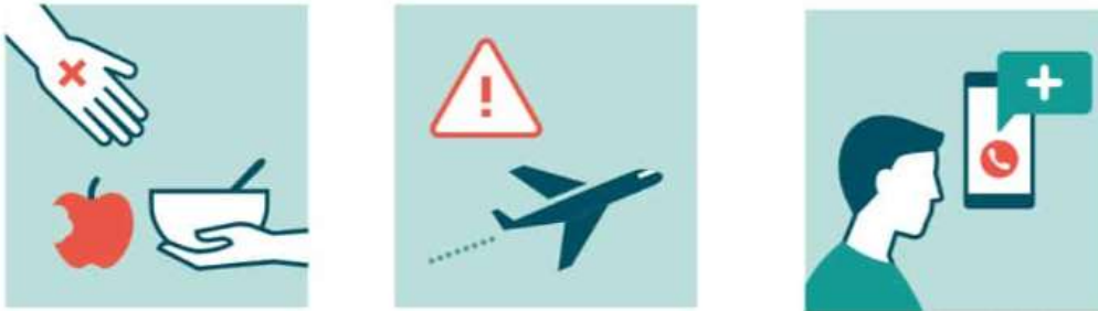
Miic1.5. Koovid-19 dalkaa kee, kalali cogdaadi