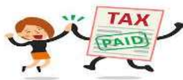
Miic 1.10: Qisô gaaboysó

Qiso akak iyyaanam baaxoh caddol ittingeyil baaxo dadalah takku baaxol xayloh qidaddoh takku loonuh yanin gaddak timmixige gaba meklaanama. Tah numtin amol